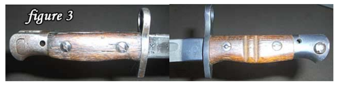
Pattern 1907 Grip Grip