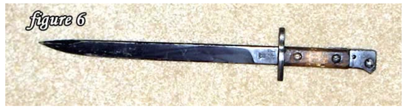
This No. 1 Mk. III* was made in May 1945 at Rifle Factory Ishapore. All total, 751,149 bayonets were produced by India from September 1939 to August 1945.

The No. 1 Mk. III and No. 1 Mk. III* were also newly made bayonets with 12.2-inch unfullered blades. Again, the difference between the two marks was the absence or presence of a false-edge. Mk. III's had crude, squared-off pommels and rectangular grips. Instead of the beautiful blued finish of the No. 1 Mk. II series, they were finished with stoving (black paint).