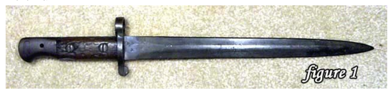
This Pattern 1903 bayonet was made in October 1903 by the Wilkinson Sword Co., London.

Almost immediately, a move was afoot to replace the Pattern 1903. The 12-inch Pattern 1888 blade was too short for use with the No. I Mk. III rifle. The prevailing opinion of the day was that one wanted the overall length of the rifle and fixed bayonet to be at least five feet. This was the minimum length deemed necessary for a soldier of average height to take a cavalryman off of his horse. Most armies held to this view up to the beginning of World War II.