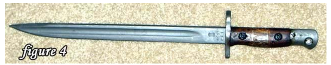
India Pattern No. 1 Mk. I** converted at Rifle Factory Ishapore.

Beginning in 1941, India issued a series of bayonets with 12.2-inch blades, based on the Pattern 1907. The first of these, the No. 1 Mk. I* (spoken: number one, mark one, star), was simply a cut down Pattern 1907. These can be of British, Indian, or Australian manufacture. They are readily identified, as the fuller runs right through the point of the shortened blade. The No. 1 Mk. I** (spoken: number one, mark one, double-star), differed only in having a two-inch false-edge ground into upper blade.