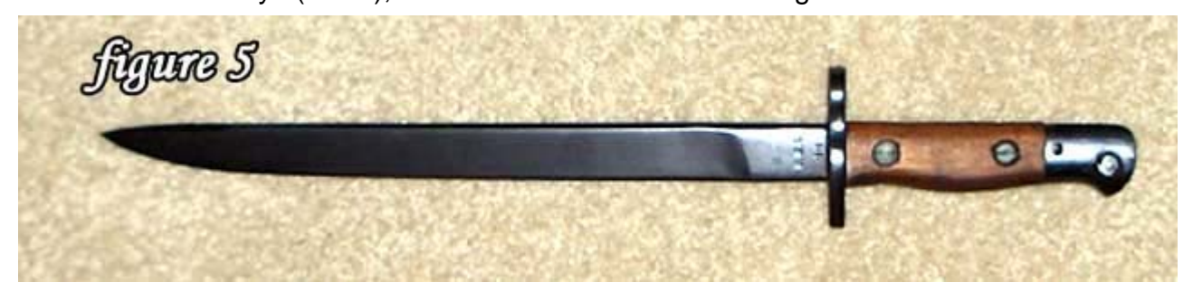
This No. 1 Mk. II* was made in 1943 in the workshops of the Bengal and North West Railways in Moghulpura. The blued finish on this piece is simply superb.

The No. I Mk. II and No. I Mk. II* were newly made bayonets with 12.2-inch unfullered blades. These retained the standard P1907 hilt and grips. The only difference between these two marks being that the former had no false-edge. No. 1 Mk. II bayonets were made at Rifle Factory Ishapore. During World War II, three additional manufacturers began producing bayonets. These were Metal Industries Lahore (MIL), the Bengal and North West Railways (NWR), and an unidentified maker using the initials "J.U."