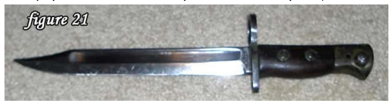
This No. 5 Mk. I bayonet was made in 1945 by the Wilkinson Sword Co. Ltd., 53 Pall Mall, London S.W. 1.

No. 5 Mk. I bayonets were also commercially produced by Sterling Ltd. for sale with the Patchett machine carbine and at Rifle Factory Ishapore in India. Sterling bayonets are marked on the blade with "Sterling" inside a rectangle. Ishapore bayonets were made in small quantity. More recently, a large quantity of RFI-marked reproductions has surfaced. The majority of RFI-marked No. 5 Mk. I bayonets encountered today are reproductions.