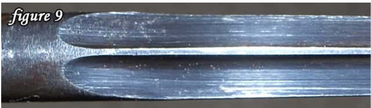
The No. 4 Mk. I bayonet, with it's distinctive cruciform blade, was forged and milled from one solid piece of steel. Only 75,000 were made, all in 1941. Singer Manufacturing Co., a U.S. company well known for their popular line of sewing machines, produced all 75,000 No. 4 Mk. I's in their factory at Clydebank, Scotland. As illustrated above, Singer marked the No. 4 Mk. I bayonets with the Royal Cypher of King George VI ("G crown R") over "No. 4. Mk. I" over "S M". Surviving examples are scarce and desirable. However, keep your eyes peeled. I found one sleeping in a gun shop and paid $15 for it.