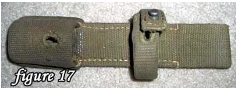
Figure 17: Carter # 316 web frog. The color of these frogs varied, with the earliest type being olive drab in color like the example pictured. As the Deutsche Afrika Korps only existed for two years, these frogs are very scarce.

Web frogs were produced for use by the Deutsche Afrika Korps (DAK), because leather does not hold up well in tropical or desert climates. DAK frogs are scarce and very desirable. They often bring more than a matching bayonet and scabbard. Fake DAK frogs abound and far outnumber legitimate examples.