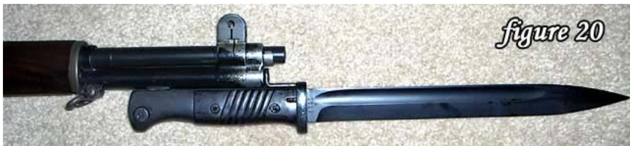
Figure 20: Now, that's how to dress up a Garand!

Israel also inherited significant quantities of German military equipment in the late 1940's, during their war of independence. The Israelis felt that the Mauser bayonet bar was too