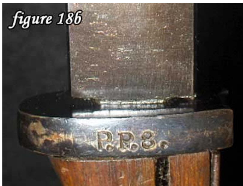
Figure 18: Spanish M1943 bayonet. The close-up photo reveals a portion of the tang visible forward of the crosspiece and the "P.R.8." marking. These features are not found on SG. 84/98 III bayonets.

The story of the SG. 84/98 III did not end with the demise of Nazi Germany. Norway inherited a quantity of Kar 98k rifles and SG. 84/98 III bayonets from their German occupiers. When the USA provided Norway with M-1 Garand rifles, the Norwegians ingeniously modified 5,000 SG 84/98 III bayonets to mount to the M-1 rifle. Designated the M/1957 SLG (Selv Lessing Gevær or Self Loading Rifle), it is distinctive in having an adapter brazed to the crosspiece that fits into the Garand rifle's gas plug (similar to the US M-5 bayonet). The scabbard is also modified to attach to the U.S.-style web equipment belt.