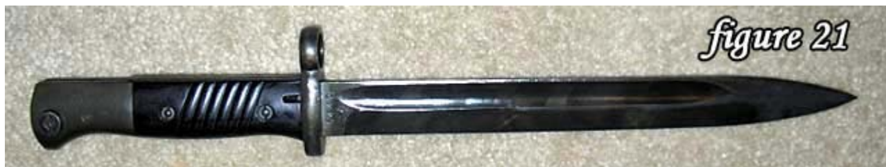
Figure 21: An Israeli M1949 conversion of the German SG. 84/98 III, with the added muzzle ring. This example was originally made by Carl Eickhorn in 1942.

weak and added a muzzle ring to their German SG. 84/98 III bayonets, designating them M1949. Although one might have expected the Israelis to remove the original German military markings, they typically did not. When the ex-German bayonets ran short, the Israelis began manufacturing the M1949 bayonet themselves. All Israeli M1949's are parkerized and not to be confused with original German phosphate finished bayonets.