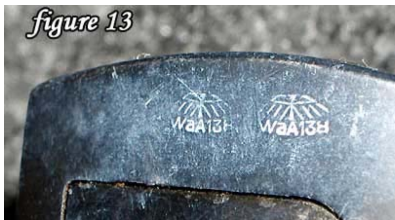
Figure 13: Droop-wing WaA138 marking on the pommel of a SG. 84/98 III bayonet. Finding a pair of waffenampts on the pommel is fairly common.