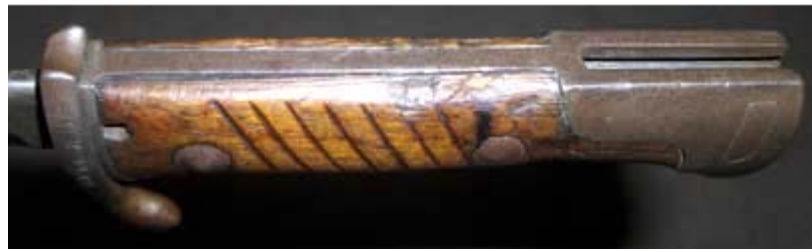
Top: Sheet-Metal Flashguard