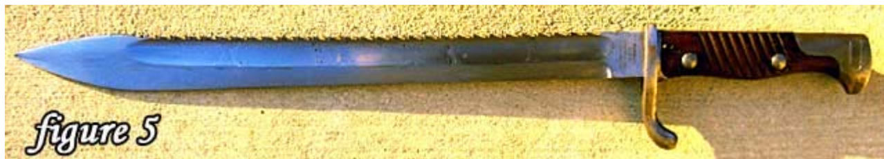
Figure 5: M1898/05 Sawback bayonet. This example was made by Weyersberg, Kirschbaum & Co. in 1916.

Beginning in 1905, two new bayonets were introduced for the M1898 rifle. The first was the well-known M1898/05 "Butcher Blade" bayonet, so named for its resemblance to a butcher's knife.