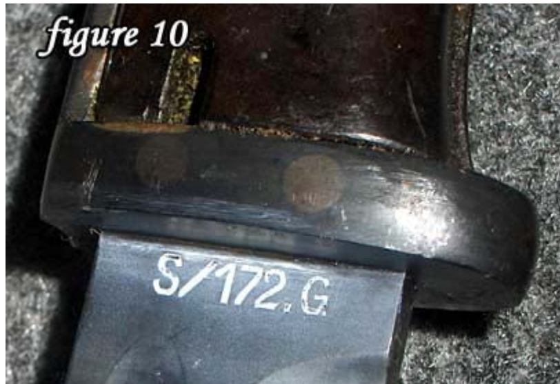
Figure10: Number Code on a SG. 84/98 III bayonet made by Carl Eickhorn. The "G" date indicates manufacture in 1935.

A letter suffix, which identified the year of production (as noted above, this was discontinued in 1936).