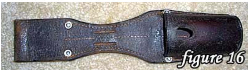
Figure 16: Carter #311 brown leather frog with four aluminum rivets. The hilt strap is absent. This example is marked Gebruder Klinge, Dresden, 1937, on the reverse.

There were many belt frogs produced for use with the SG 84/98 III bayonet. In his book, Bayonet Belt Frogs , the late Anthony Carter documented 28 distinct variations for the SG. 84/98 III bayonet. The most common were of black or brown leather. Some frogs have maker's markings on the reverse, but many do not.