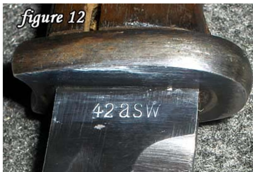
Figure 12: - Letter Code “asw” for E. & F. Hörster & Cie. on a SG. 84/98 III made in 1942.