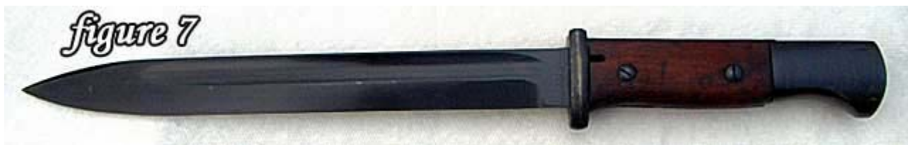
Figure 7: SG. 84/98 III bayonet. This example was made by E. & F. Hörster & Cie., Solingen in 1940.