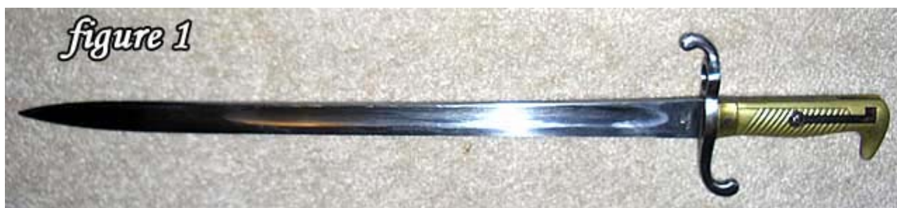
Figure 1: M1871 sword bayonet made at the Prussian Royal Arsenal at Erfurt in 1878, using a blade manufactured by Gebruder Simpson of Suhl (the forerunner of Simpson & Co.)