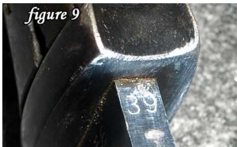
Figure 9: Bayonet showing the two-digit date on the spine. This example was made by the Elite Diamantwerke in 1939.

Initially, a letter was inserted into the maker's mark to denote the year of manufacture. K=1934, G=1935, and S=1936. In 1936, this approach was discontinued and a two-digit year was used instead. Initially, bayonets were dated on the spine. The date was later moved to the ricasso, with adoption of the letter codes in 1940.