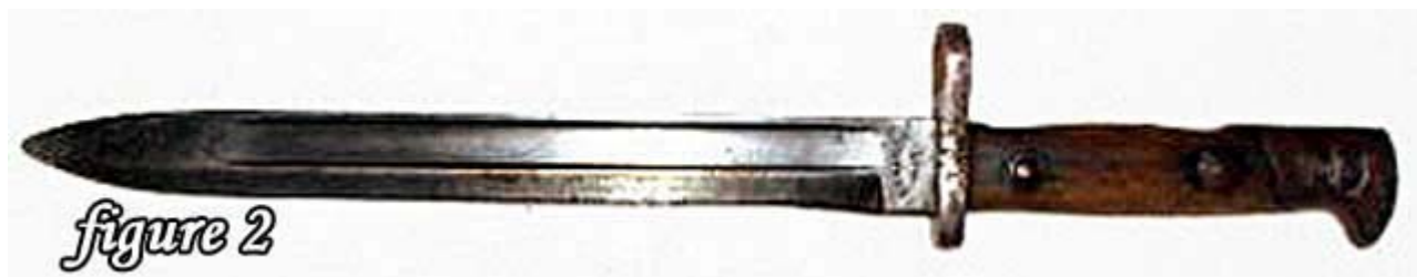
Figure 2: M1871/84 knife bayonet made in 1886 by C.G. Haenel of Suhl.

The legendary Mauser Gewehr 98 (M1898 rifle) is one of the outstanding military rifles of all time. Although best known for its superb receiver and bolt design, the M1898 also introduced a groundbreaking bayonet mounting approach. Prior to the M1898, all sword and knife bayonets were supported at the rear by a bayonet lug and at the front by a muzzle ring. However, contact between the muzzle ring and barrel adversely affected accuracy. The M1898 introduced a more substantial bayonet mounting bar that could adequately support a bayonet without need of a muzzle ring.