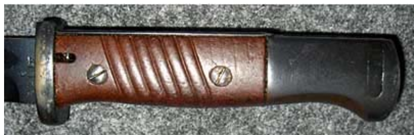
Top: Wood Grips