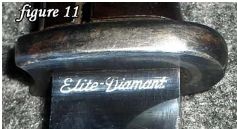
Figure 11:- Commercial trademark of Elite Diamantwerke on a SG. 84/98 III made in 1939.

In 1936, Germany openly renounced the Treaty of Versailles. This made the Number Codes unnecessary, so makers simply began marking bayonets with their commercial trademark. There were also some trademarked SG. 84/98 III bayonets made for commercial sale, mostly to local police departments. However, these are uncommon.