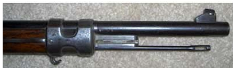
Top: Mauser bayonet lug on a M1893