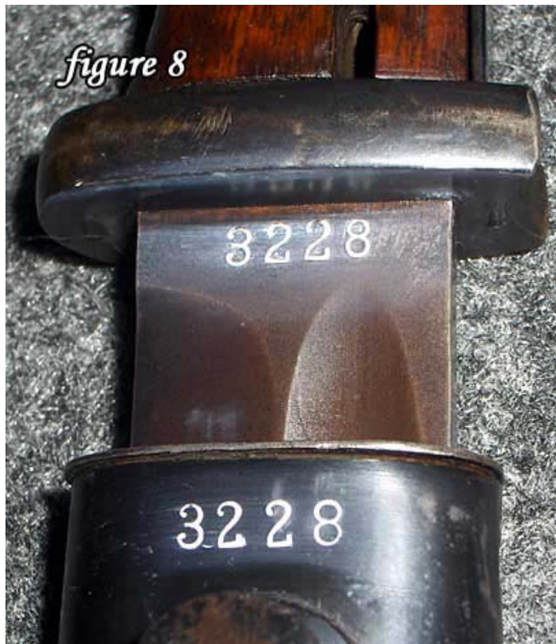
Figure 8: Bayonet and scabbard showing matching serial numbers. This example was made by Richard A. Herder in 1937.

Initially, a letter was inserted into the maker's mark to denote the year of manufacture. K=1934, G=1935, and S=1936. In 1936, this approach was discontinued and a two-digit year was used instead. Initially, bayonets were dated on the spine. The date was later moved to the ricasso, with adoption of the letter codes in 1940.