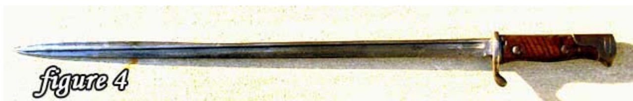
Figure 4: At 25 \frac{3}{4} inches long, the M1898 was the longest bayonet produced for the Gewehr 98 rifle. This example was made by Simpson & Co. in 1906.

Beginning in 1905, two new bayonets were introduced for the M1898 rifle. The first was the well-known M1898/05 "Butcher Blade" bayonet, so named for its resemblance to a butcher's knife.