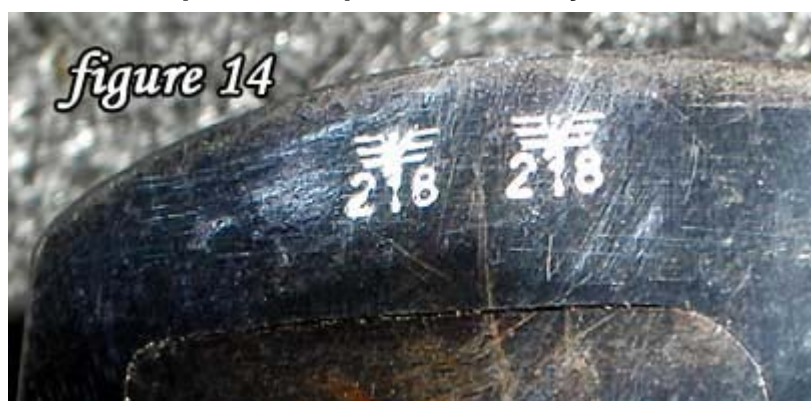
Figure 14: Straight-wing WaA218 marking on the pommel of a SG. 84/98 III bayonet. Visit one of the code listing sites and see if you can identify the maker of this bayonet by the waffenampt.